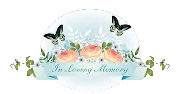
Carol Ann Pape Eitel (May 30, 1936 – April 23, 2023)

You may telephone the following number: 1-646-558-8656. You will be asked for a Meeting ID and a passcode. (Please see paragraph 3.) You won't be able to see us, but you can still hear what's going on.